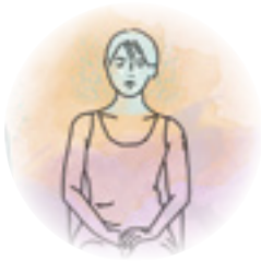
Heartfulness Relaxation 12