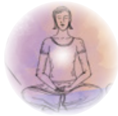
Heartfulness Meditation 14