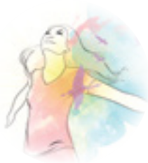
Fear Detox 79