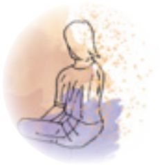
Heartfulness Cleaning 16