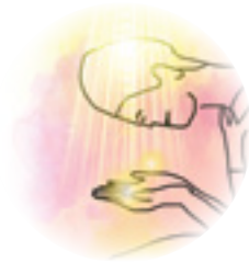
Heartfulness Prayer 18