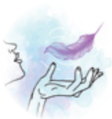
Krodha (Anger) Detox 70