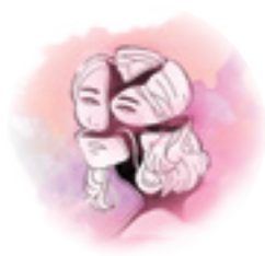
Stress Detox 95