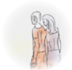
Kama (Sex) Detox 89